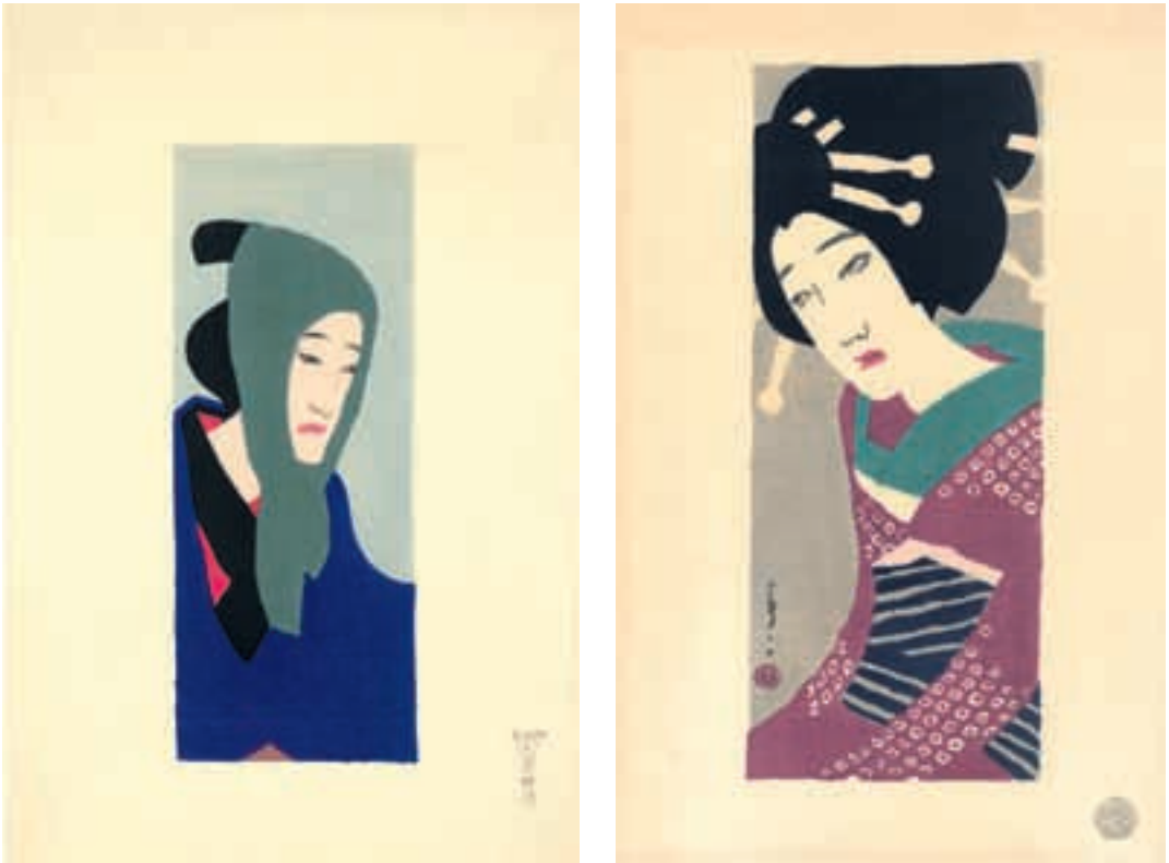
FIG. 1.9 Takehisa Yumeji, Koharu-Jihei , 1914–16. Woodcut. Sold by Minatoya and Yanagiya. Nihon no hanga Collection, Amsterdam.

way they carried themselves were astonishingly similar. During the days when the streets were filled with young women in the Yumeji style, he would often say how eerie it was to bump into someone who was wearing a piece of clothing from the Minatoya that he had designed. 41