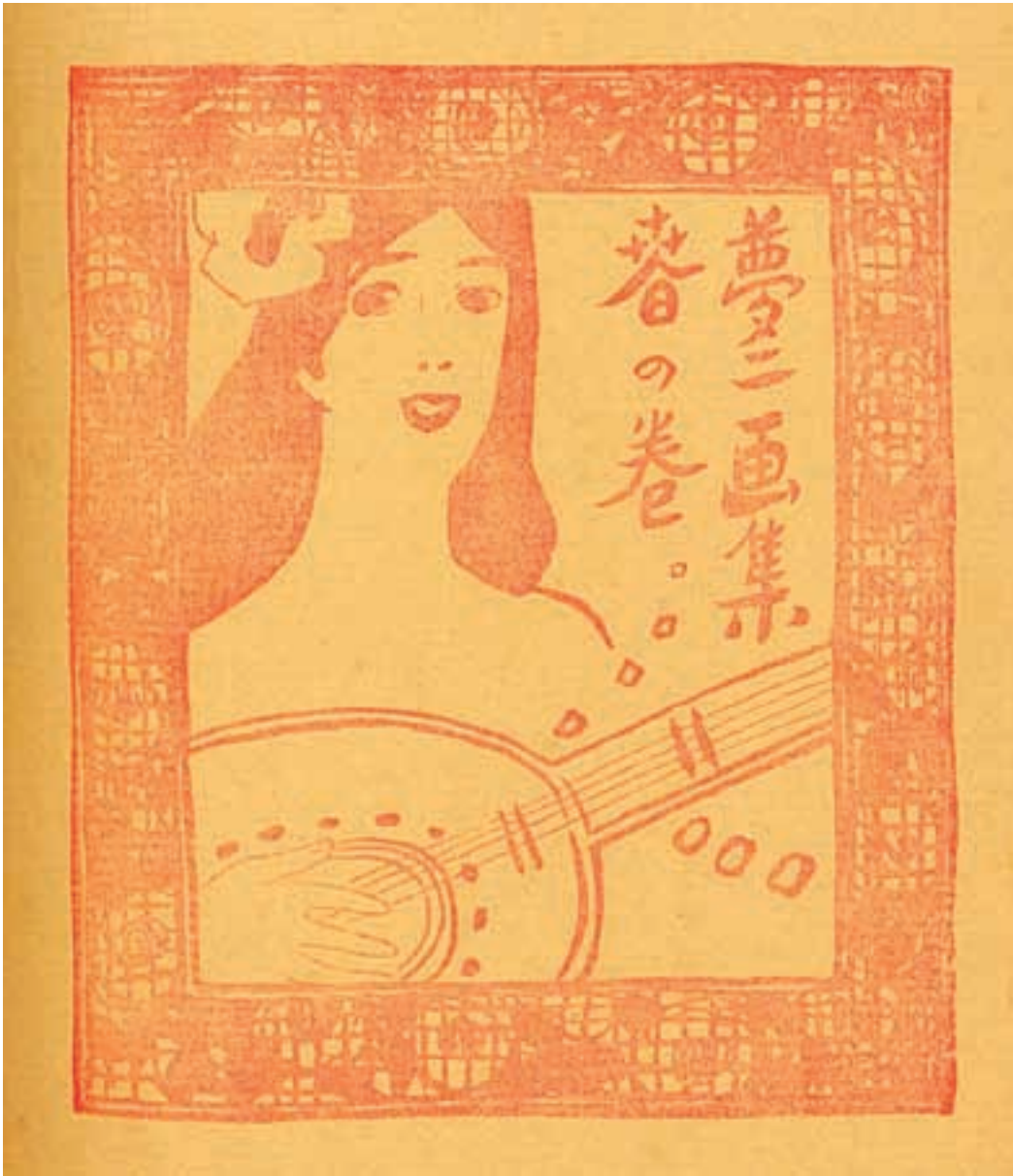
FIG. I.5. Title page of Takehisa Yumeji, Yumeji gashū: Haru no maki (Yumeji collection of works: Spring volume) (Tokyo: Rakuyōdō, 1909). Yumeji Art Museum, Okayama, Japan.