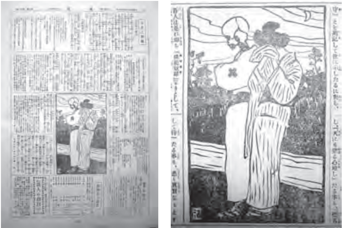
FIG. I.4. Takehisa Yumeji, Shōri no hiai (The sorrows of victory). From Chokugen , vol. 2, no. 20, June 18, 1905. (left) Complete newspaper page and (right) detail. Original woodcut reproduced mechanically for newspaper publication (zinc plate relief printing), 37.6 x 26.6 cm. Seal: 酒 (most likely read Asami ).

Yumeji's involvement in a variety of publication types also facilitated the evolution of a multifarious artistic expression, especially as it relates to his more political illustrations.