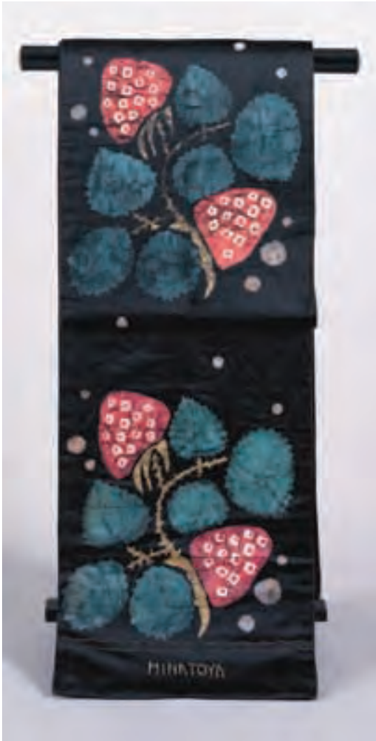
FIG. 1.8. Takehisa Yumeji, Obi, Ichigo (Obi sash, strawberry), 1914–15. Silk sash with hand coloring, 374 x 31 cm. Yumeji Art Museum, Okayama, Japan.

pleasure in both possessing a commodity item as well as appreciating its artistic value. Parallels can be drawn to Arjun Appadurai’s seminal discussion of luxury goods, which elucidates our understanding of the object (or commodity) and its social life, which includes both belonging and camaraderie, thus allowing for the “transformation of the consumer,” whereby Minatoya products can be interpreted as both commodities for use and commodities with “rhetorical and social” value. 35 The construction of a shared identity and subjectivity through these objects becomes an essential function. 36 Moreover, the success of Yumeji’s Minatoya and his entrepreneurial approach to artistic creations as brand products led artists of the next generation, most notably those making bijinga or shōjo (young woman) imagery, such as Nakahara Jun’ichi (1913–1983), to open shops or design similar items for sale. 37