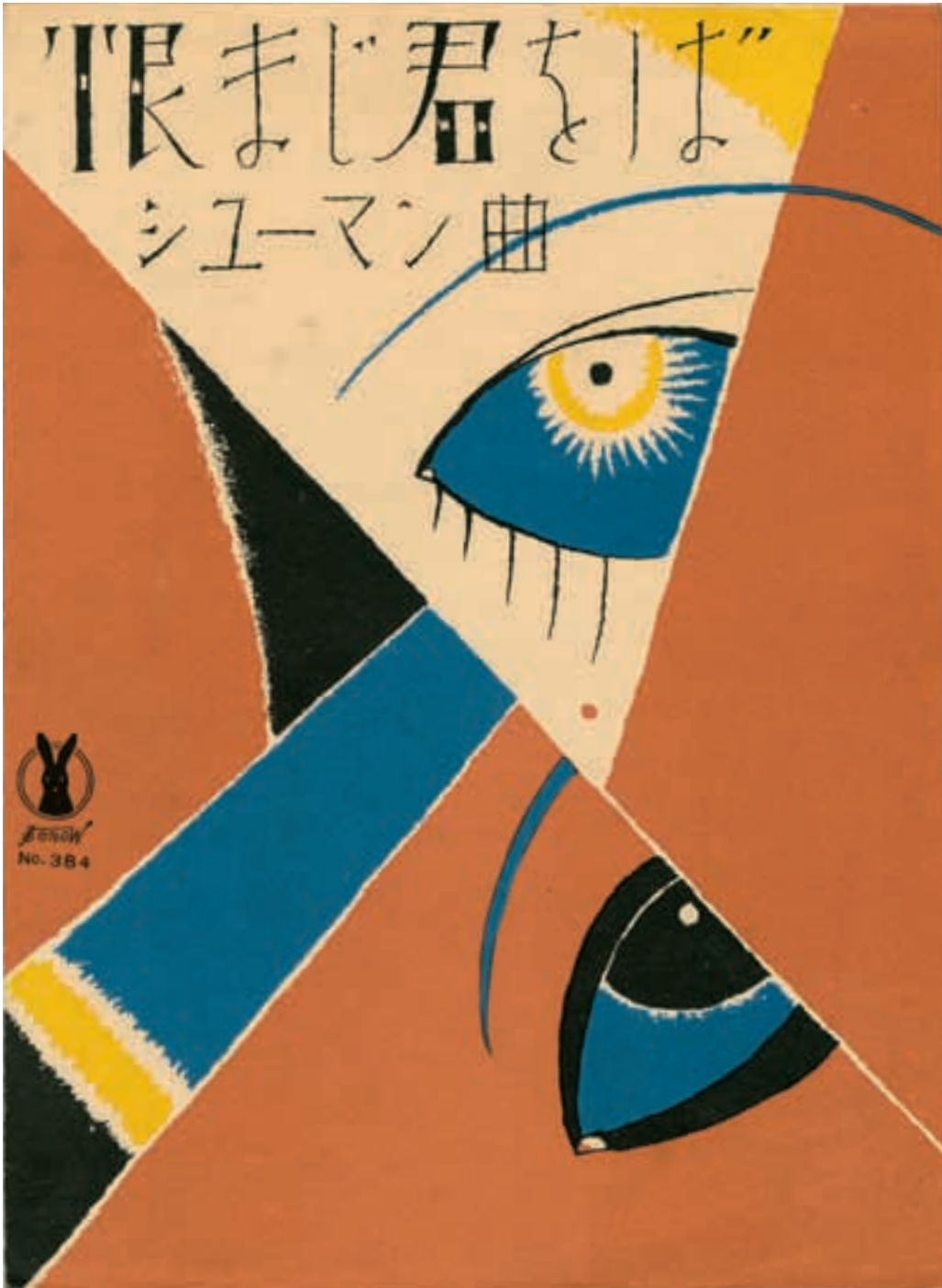
FIG. 1.6. Takehisa Yumeji, Uramaji kimi o ba (Ich grolle nicht), 1925. From Senow gakufu (Senow music scores), no. 384, composed by Robert Schumann. Nihon no hanga Collection, Amsterdam.