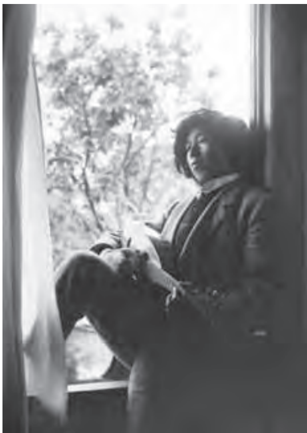
FIG. 1.2. Takehisa Yumeji with mandolin at the Horiuchi house, 1910. Yumeji Art Museum, Okayama, Japan.

a full suit and looking slightly downward, his head tilted to the side. The composition is intended to convey the figure of the modern, cultured bohemian artist; the Italian mandolin in his lap, an exotic foreign instrument newly introduced to Japan in the early twentieth century, reinforces this. Yumeji was a master of self-fashioning, and even today we are drawn into his spell as we attempt to separate the interpretation of the artist and his work from the image he created, which was kept alive by his fans and consumers.