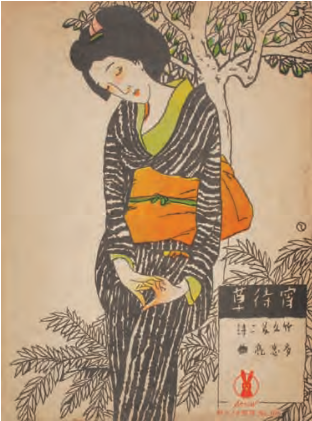
FIG. I.1. Takehisa Yumeji, Yoimachigusa (Evening primrose), 1918. From Senoō gakufu (Senow music scores), no. 106. Lithograph, 31 x 22.7 cm. Kanazawa Yuwaku Yumeji-kan Museum.