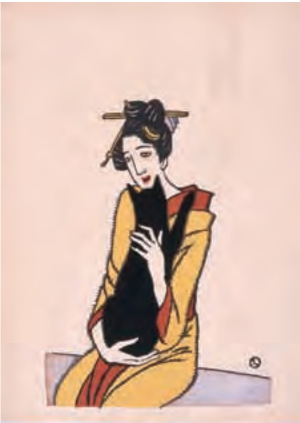
FIG. 1.3. Takehisa Yumeji, Kuroneko o daku onna (Woman holding a black cat), 1920s. Color woodcut. Sold by Yanagiya. Kanazawa Yuwaku Yumeji-kan Museum.

Nonetheless, the belief (or illusion) that these women were grounded in actuality enchanted Yumeji's audience. The existence of a Yumeji-shiki woman offered a sense of affinity that his contemporary viewers could project onto women of their own era. It could be conjectured that Yumeji's understanding of this effect may have led him to position his source of inspiration as an ideal rather than a real person. This would have further perpetuated the syncopation between an