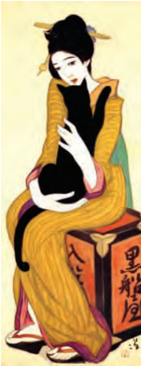
FIG. 1.3. Takehisa Yumeji, Kurofuneya (Black ship shop), 1919. Color on silk, 130 x 50.6 cm. Takehisa Yumeji Ikaho Museum.

description of the much later phenomenon of the late 1980s Japanese media convergence and the cross-media dissemination of entertainment merchandise particularly associated with anime characters. 31 Although here the context and period are different, the concept of character merchandising—in essence a relationship between an image or brand and its commoditization across multiple media platforms—is instructive when interpreting Yumeji’s pioneering endeavors in branding his objects. By the early twentieth century, Yumeji was already involved in a type of intermedia branding. This book aims to contribute to the field of media studies and to art history and visual culture, targeting a broad range of specialists and students interested in popular culture, design history, graphic design, and consumer culture. 32