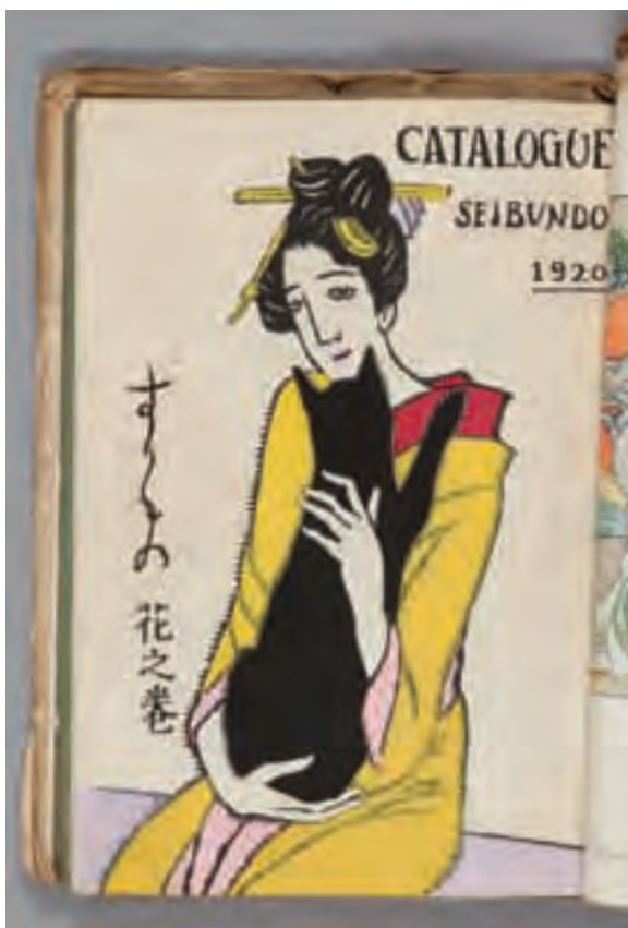
FIG. 1.2. Takehisa Yumeji, Kuroneko o daku onna (Woman holding a black cat), 1920. Cover for the magazine Surimono: Hana no maki (Printed things: Flower volume), Seibundō catalog. Color woodcut. Kanazawa Yuwaku Yumeji-kan Museum.