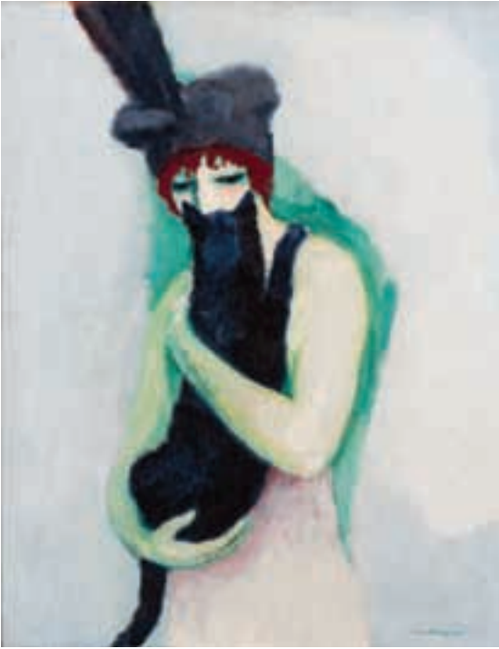
FIG. 1.1. Kees van Dongen. Woman with Cat , 1908. Oil on canvas, 91.76 x 73.66 cm. Milwaukee Art Museum.

Flower volume; fig. 1.2) and for prints (fig. 1.3), with variations in the color of the woman's kimono. 9 Kawase Chihiro suggests that the novel Kuroneko (Black cat) by the contemporary writer Izumi Kyōka (1873–1939) may have also served as a literary influence on Yumeji's painting. 10 Izumi Kyōka's novel recounts the especially close relationship between the female protagonist and her corpulent black cat. It is important to note that Yumeji draws from both Western artistic influences as well as Japanese literary sources.