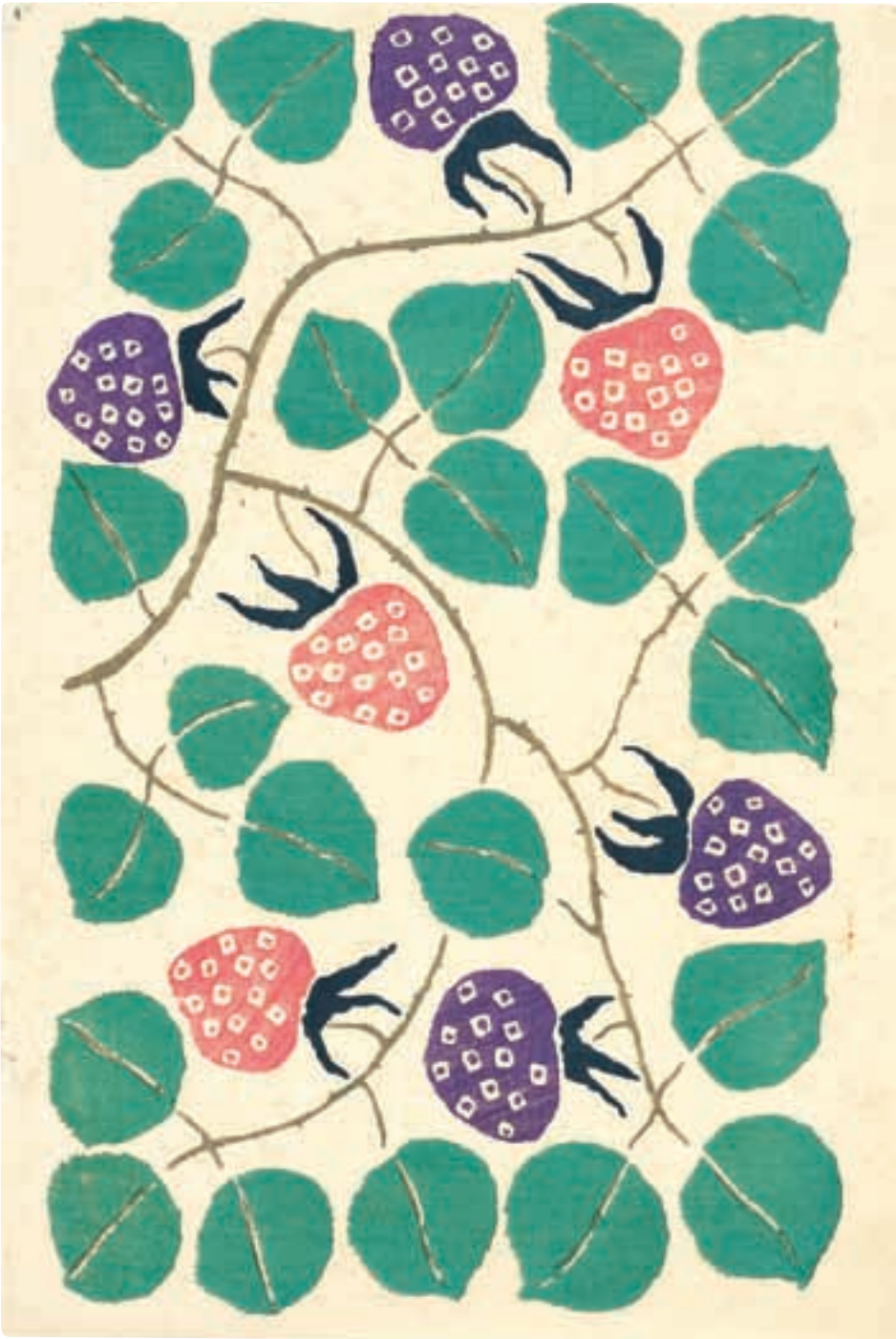
FIG. 1.7 Takehisa Yumeji, Ichigo (Strawberry), 1914–15. Color woodcut, 18.7 x 26.7 cm. Yumeji Art Museum, Okayama, Japan.